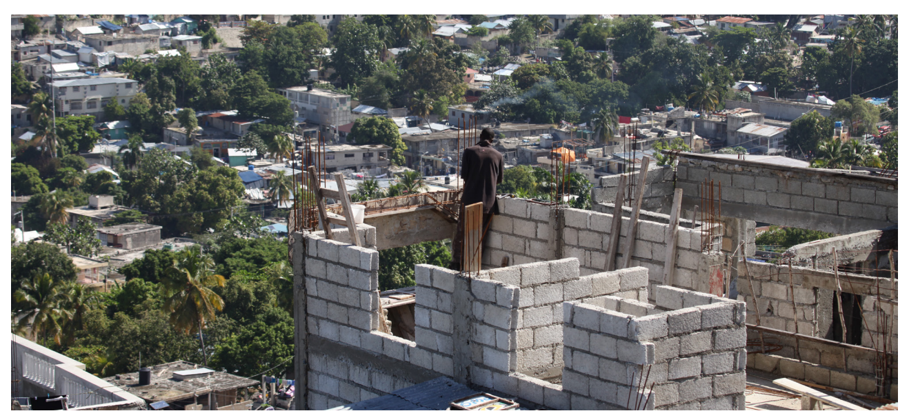
An over view of Slum Houses in Port-Au-Prince, Haiti

Indicator 11.1.1 Proportion of urban population living in slums, informal settlements or inadequate housing