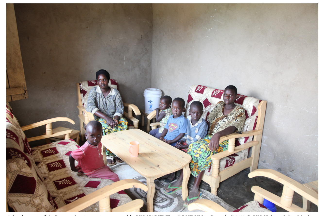
A family at one of the Bugesera housing project supported by UN-HABITAT and ONE UN in Rwanda (2012)