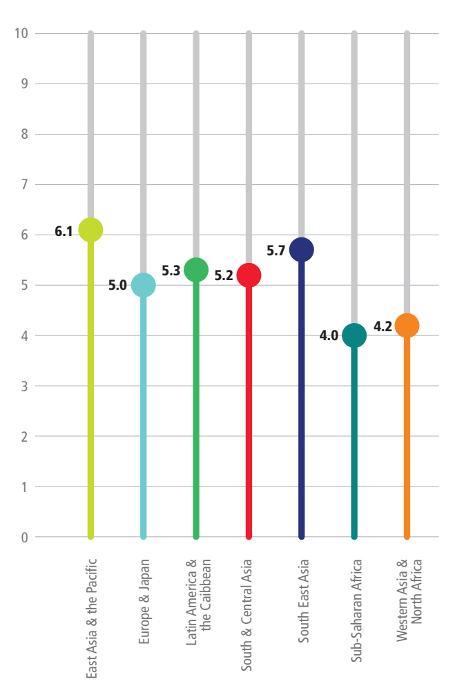
Fig. 1: Unweighted averages of occupant household affordability Price-to-Income-Ratio in the housing sector as a whole

ne of the most daunting challenges of urbanization globally has been the provision of adequate housing that people can afford. Findings from the UN Global Sample of Cities show that people across all types of urban centres are not able to afford home ownership or even the cost of rental housing.