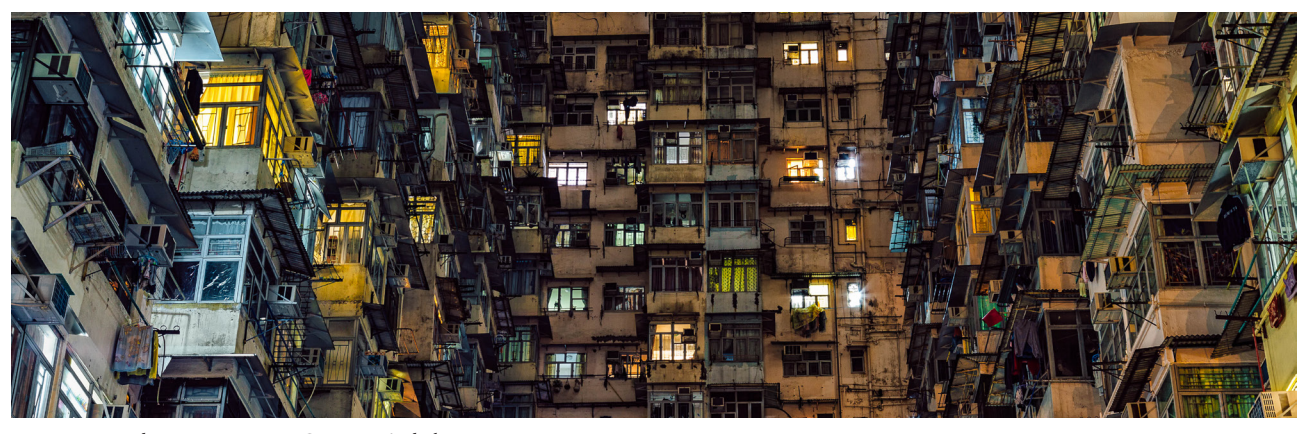
Housing complex in Hong Kong.

While the most common problem is the shortage of adequate housing, other important challenges lay in the poor quality and location of the housing stock - usually far from jobs and livelihood opportunities -, the lack of accessibility and services, unaffordable costs, and insecurity of tenure. Some countries have managed to provide affordable housing at scale, yet often by repeating mass housing schemes, built on cheap and peripheral land, where people have limited access to services, jobs and opportunities. From slums to gated communities, from overcrowding to sprawl, from homelessness to vacant houses, there is much evidence that housing is shaping cities worldwide despite regional, demographic, socioeconomic, and cultural specificities.