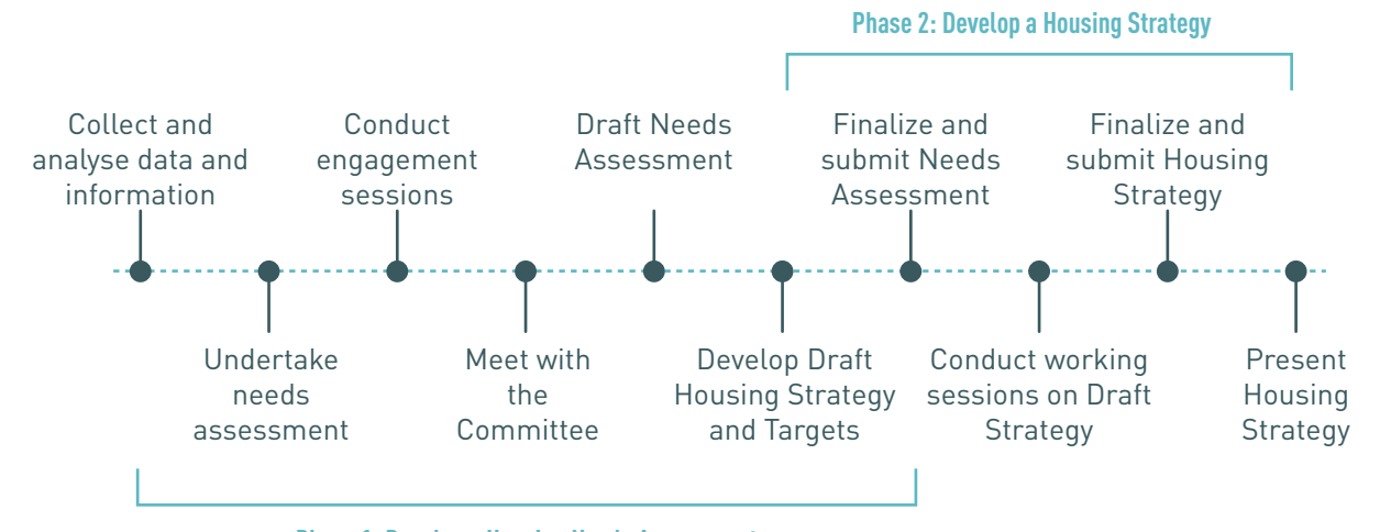
Phase 1: Develop a Housing Needs Assessment

The second phase of work involved the development of a housing strategy which includes recommendations for addressing the key housing needs and gaps in Medicine Hat based on three facilitated co-design sessions with key housing and homelessness stakeholders, an environmental scan of best and promising practices, a review of the policy framework, and an environmental scan of current funding opportunities. This phase of work also includes the development of affordable housing targets for Medicine Hat.