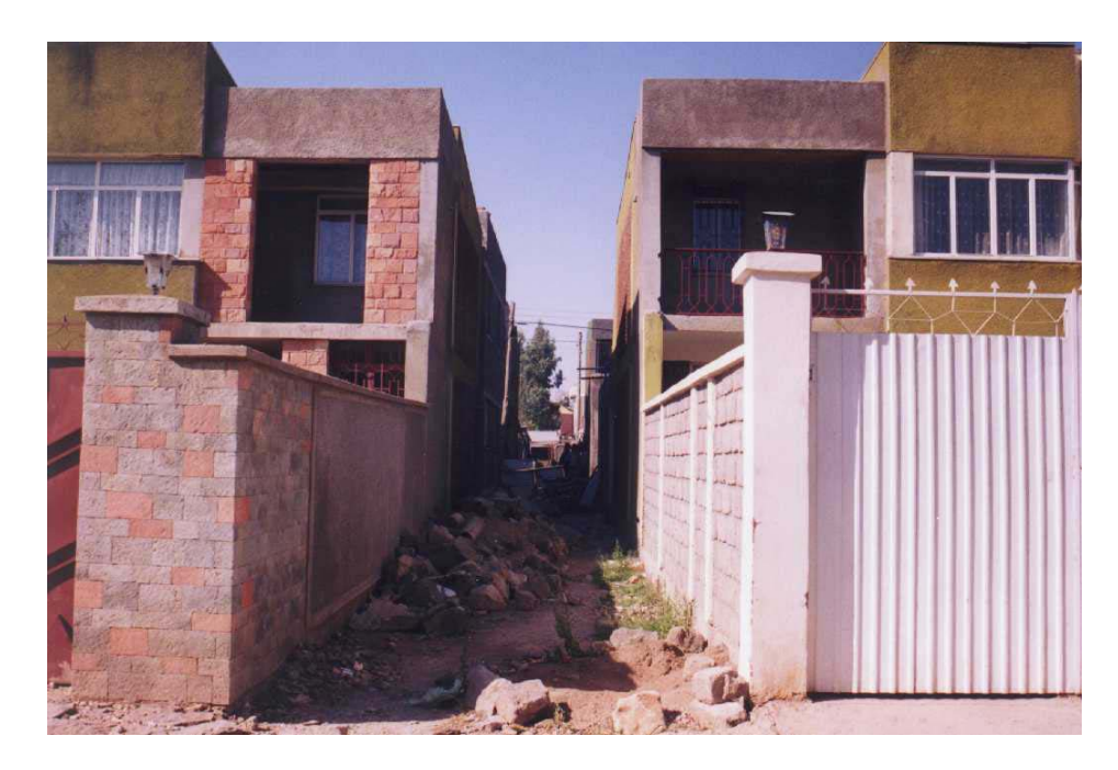
Buildings under construction stage