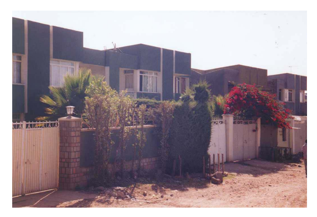
Building project with incomplete infrastructure in Bole Area