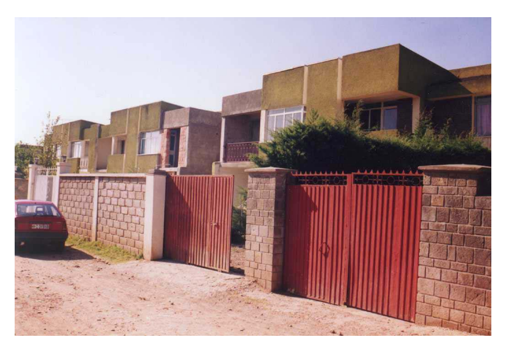
Building project with incomplete infrastructure in Bole area