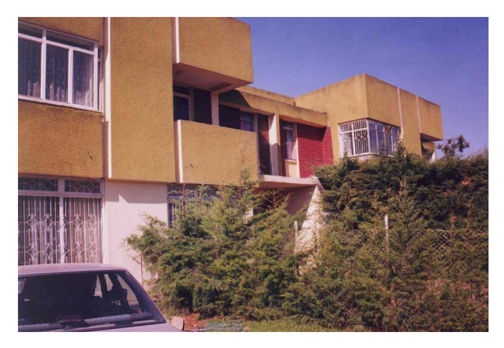
Modification of facade from the original design