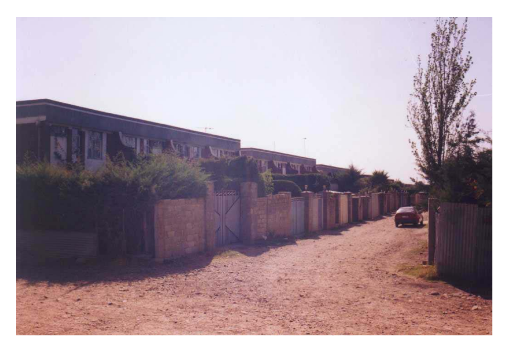
Incomplete road and drainage system