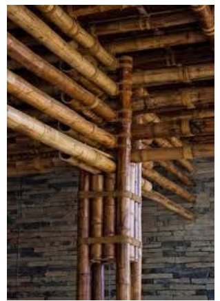
Fig. 7. Beam Column Joint