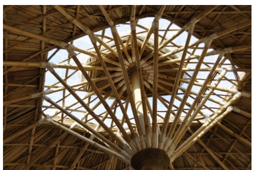
Fig. 8. Bamboo Roof