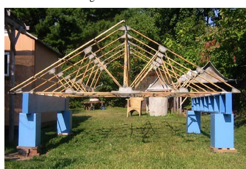
Fig. 9. Bamboo Truss