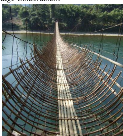
Fig. 3. Hanging Bamboo bridge over Siang River, Arunachal Pradesh, India