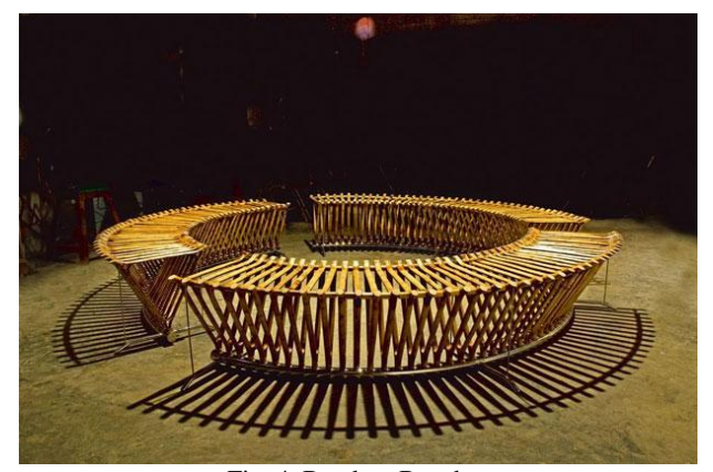
Fig. 4. Bamboo Benches