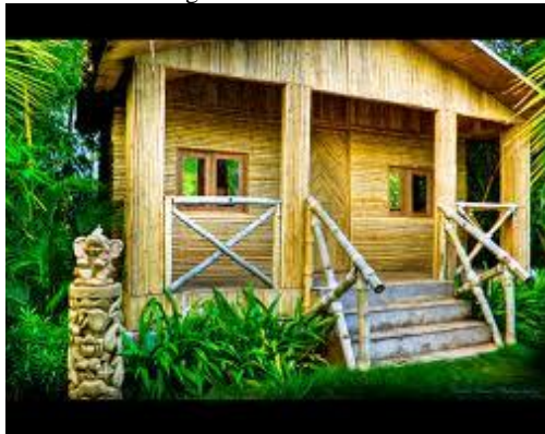
Fig. 10. Bamboo house