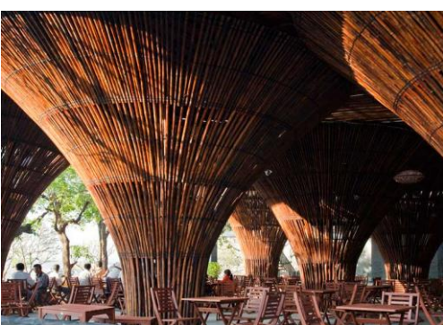
Fig. 6. Layered Bamboo Columns

C. Use of Bamboo In Various Housing Components Bamboo has very good mechanical properties so it can be used in buildings as a structural component like columns and beams. It can also be used for roofing and flooring.