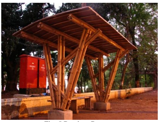
Fig. 5 Bamboo Busstop

C. Use of Bamboo In Various Housing Components Bamboo has very good mechanical properties so it can be used in buildings as a structural component like columns and beams. It can also be used for roofing and flooring.