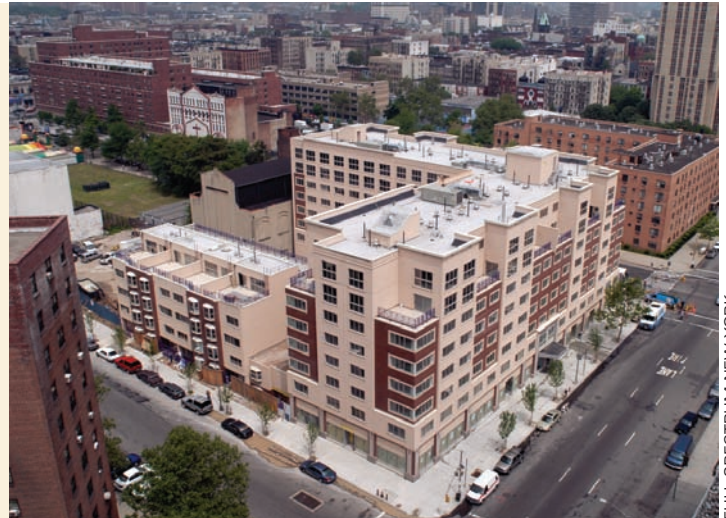
FULL SPECTRUM NEW YORK

The developer listened: 1400 on 5th includes a smart-security system, a 24-hour attended lobby, and a private parking garage. The development is LEED certified; it uses geothermal heat pumps and its air-ventilation system brings in fresh air to enhance indoor air quality. West African design elements reflect-