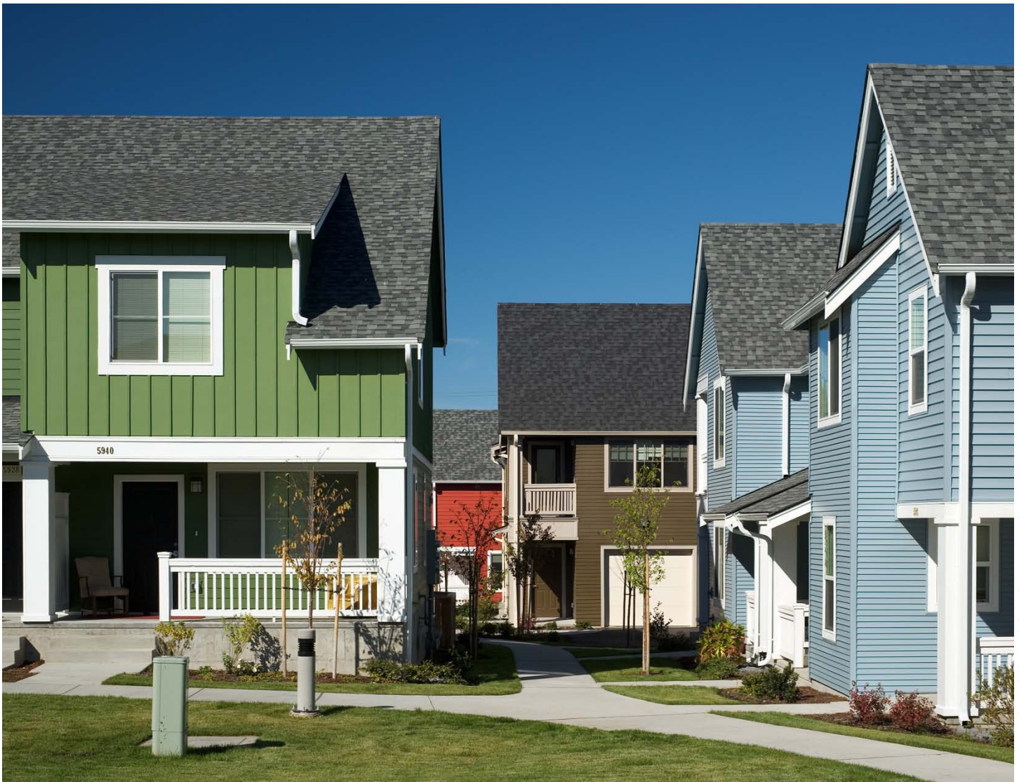
MITHUN ARCHITECTS + DESIGNERS + PLANNERS

ing. Their opposition to the local development of affordable housing may not serve the self-interest they believe they are protecting.