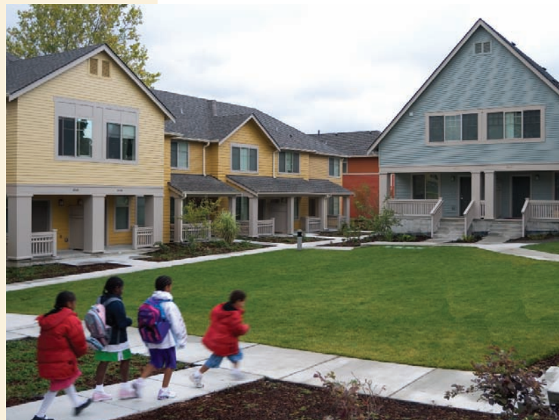
MITHUN ARCHITECTS + DESIGNERS + PLANNERS