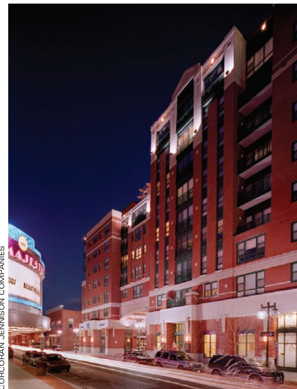
Corcoran Jennison's Park Square West luxury apartment development in Stamford, Connecticut, reserves 20 percent of the units as affordable. Low-income housing tax credits were allocated for the affordable units.

People who seek simplicity should not pursue a career in affordable housing. It is a complex endeavor with layers of financial, political, and regulatory requirements. There are, however, a limited number of programs and concepts that must be mastered. Understanding affordable housing loans, grants, and other programs and their requirements is the foundation for a career in this field. Mastering the art of affordable housing can be difficult and challenging, but ultimately rewarding on several levels.