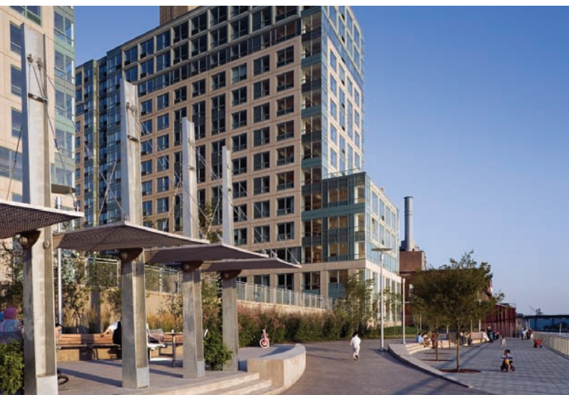
KENT WATERFRONT ASSOCIATES

Schaefer Landing in Brooklyn, New York, combines 140 affordable rental units and 210 market-rate luxury condominiums.