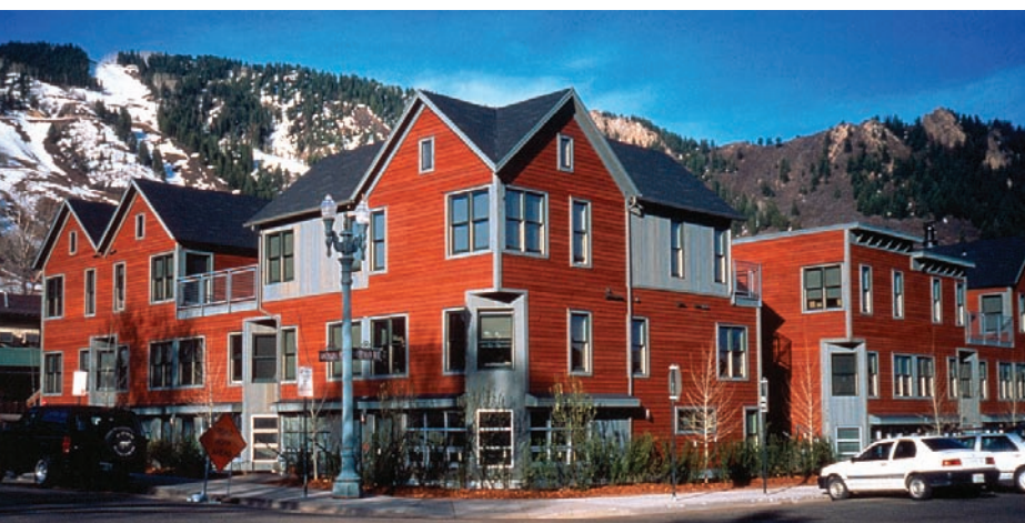
JONATHAN ROSE COMPANIES

It is now widely accepted that much of the public housing built in the mid-20th century was a massive failure—its configuration too isolating, its scale too dense, its towers too tall, its residents too uniformly poor. Unfortunately, powerful negative images of failed high-rise, public housing developments and their associated social problems have been burned into the country's collective consciousness, leaving a lingering negative perception of affordable housing. People are still less familiar with the attractive, lower-density, mixed-income communities where much of today's affordable housing development is taking place; in these communities, most residents cannot tell the difference between the market-rate units and the affordable ones.