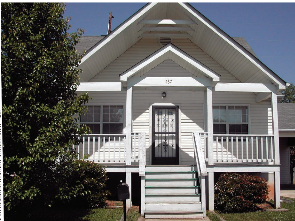
Orchard Village in Chattanooga, Tennessee, provides affordable for-sale housing to very low- to moderate-income families and seniors. The community received a ULI Award for Excellence.

plays in maintaining a healthy and vibrant regional economy.