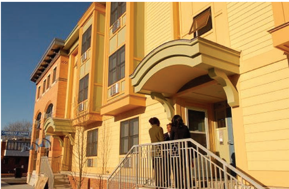
Affordable housing at Trolley Square in Cambridge, Massachusetts, was developed through a partnership between Homeowner's Rehab, Inc., (HRI) and Enterprise Community Partners.

smoothing of the entitlement process keeps the private sector developer confident, on track, and on schedule—and helps make it possible for the developer to assume the risks and to produce an outcome that reflects both the community vision and the market reality.