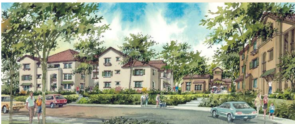
BRIDGE HOUSING CORPORATION

BRIDGE Housing Corporation has partnered with the Irvine Company to build 150 affordable apartments in the Woodbury master-plan development on the Irvine Ranch in Orange County, California. Woodbury offers a variety of types of for-sale housing that range in price from the low $400,000s to more than $1 million. The Woodbury Walk Apartments are located adjacent to the Woodbury Town Center, providing residents with walking access to a full-scale grocery store. The apartments are scheduled for completion in fall 2007.