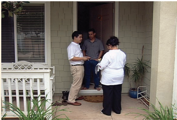
An open house facilitated by Consensus Planning Group to build community support for a project.

Consensus Planning Group, which has been building community support for more than 20 years in some of California's most NIMBY-centric and antidevelopment neighborhoods and cities, developed a strategy for proactive communication from project conception to project completion. Designed to build trust, the outreach plan focuses on building grass-roots support and engaging not only tenants and neighbors, but also community institutions and opinion leaders. Cultural sensitivity to the bilingual community was