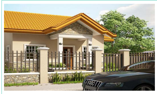
Figure 2: Low cost affordable house of 18 Million Rwandan francs.

housing providers to access lower cost debt for longer terms unlocking desperately needed "fit-for-purpose" funding into the sector in Rwanda.