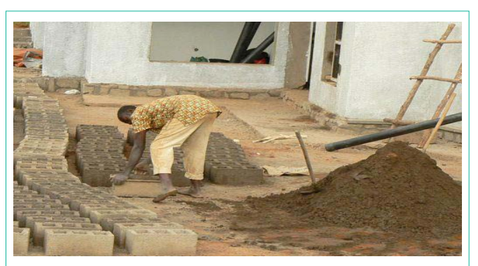
Figure 6: Priced out; the challenges for young professionals.

operated and others are powered with electricity or petroleum (Figures 4 & 5). Manual presses are operated by semi-skilled workers, whereas powered machines need more skilled operators and are more expensive to run.