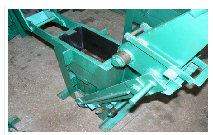
Figure 5: Electrical presses machine.