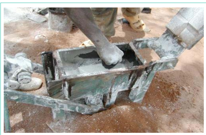
Figure 4: Manual presses machine.

increase affordability while maintaining commercial viability. These strategies are not a formula, but suggested ingredients that we expect will improve the chances of success.