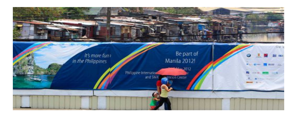
Figure 5: Cities without slums – The ultimate goal?<sup>397</sup>

there are cases where pictures are worth the proverbial thousand words, this is almost certainly one of them.