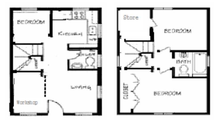
Figure 3: 34m<sup>2</sup>ground floor plan with additional 2 rooms on the second floor to be added as and when need arises.

as the family grows or as more resources become available. The design that relates to the traditions of local people with capacity of 7 people (the average household size in Pakistan is 6.8 [37]) may be a solution in opportunity for disaster struck areas. The pre-designed house plan (Figure 3) includes three bedrooms, a kitchen, two washrooms, workshop and a social area. The units had a two-storey plan with bathrooms and the kitchen placed on same wall to optimize services installations. To ensure privacy, the windows are placed at the opposite side of the entrance door. This not only facilitates cross ventilation in the room but also brings a better visual impression when entering the space, making it also look bigger. The pre-fabricated units are lighter compared with masonry constructions so this reduces construction cost of foundations.