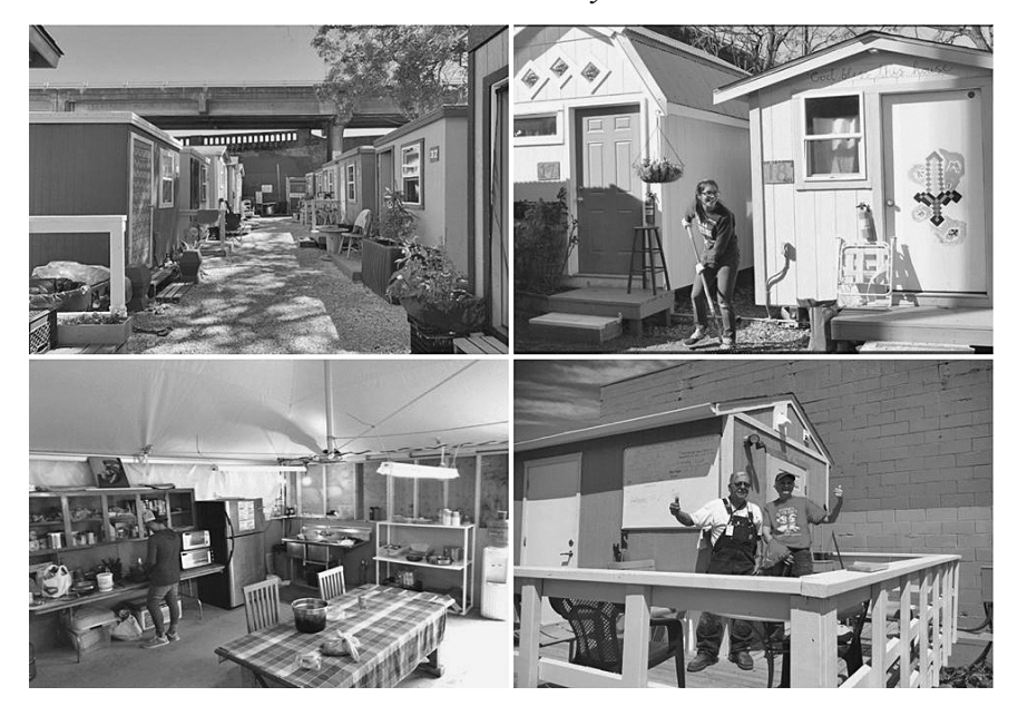
FIGURE 1: Interbay Village Collage, Low Income Housing Institute

The villages often encourage sharing and social cohesion through communal spaces and shared facilities.<sup>20</sup> In many villages, "[r]esidents often share basic amenities such as bathrooms, water, and cooking facilities as well as green spaces and other basic resources."<sup>21</sup> The villages foster community enhancement through sustainable design practices, gardening, and sometimes sweat equity, in which residents contribute to the construction of homes or shared facilities.<sup>22</sup> Some villages provide microenterprise opportunities, social, health, and job placement services to connect residents to opportunity.<sup>23</sup> The communities, therefore, endeavor to provide more than just shelter by providing opportunities to restore residents' dignity and connections to community and opportunity.<sup>24</sup>