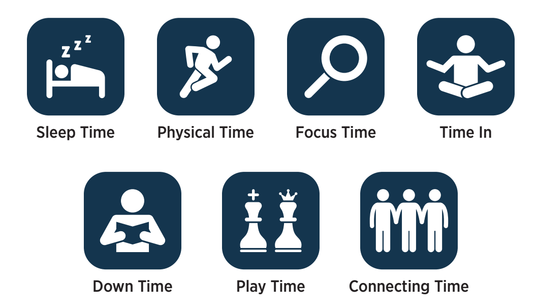
FIGURE 3.1-1: THE HEALTHY MIND PLATTER