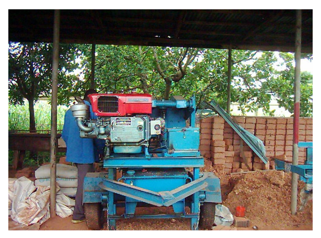
Figure 1: Hydraulic Machine developed by NBRRI, Lagos.

pollutants; to reduce the use of energy; to cut down the use of natural resources (including water); and to minimize the amount of waste generated. One of the effective ways to deal with negative environmental impact of concrete is to reduce the total volume of this material needed for a certain construction process by enhancing its performance (Joseph, 2010).