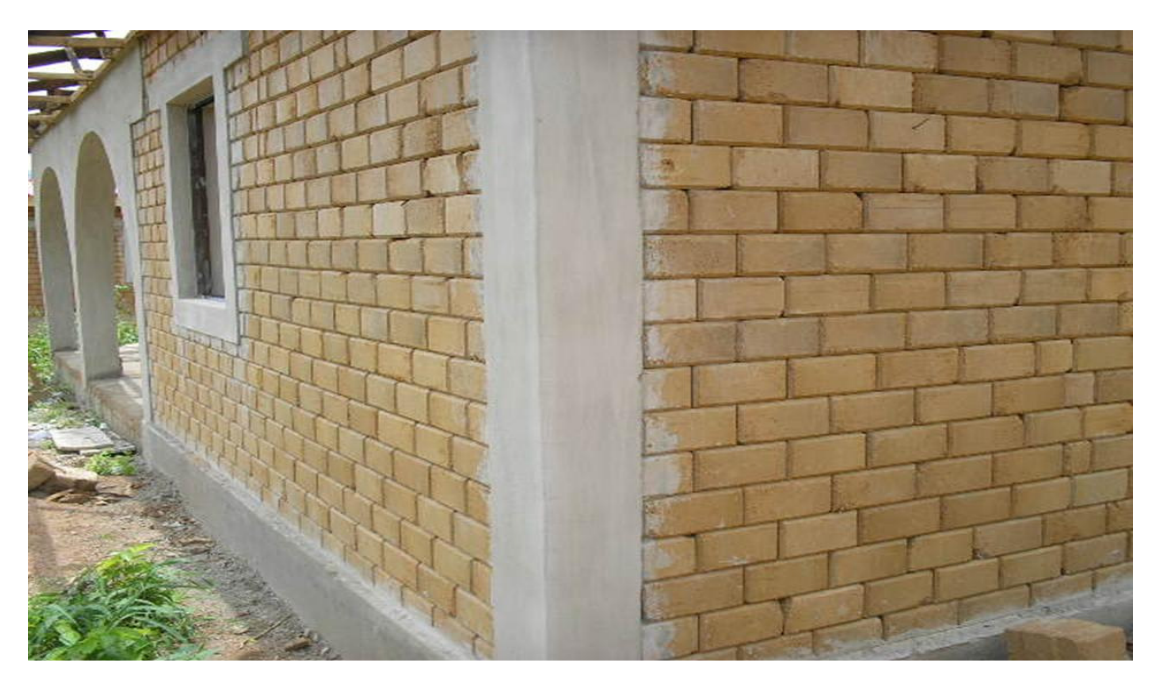
Figure 3: Interlocking Masonry at the Finishing Stage of a Housing Project.