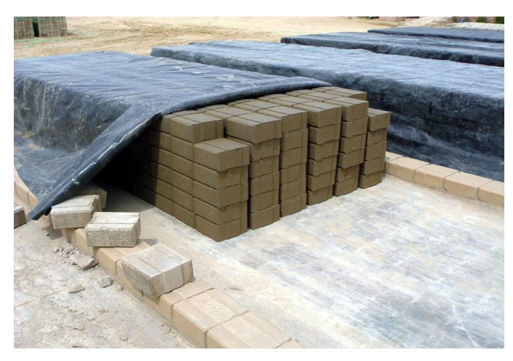
Figure 2: Stacking of Solid Interlocking blocks.