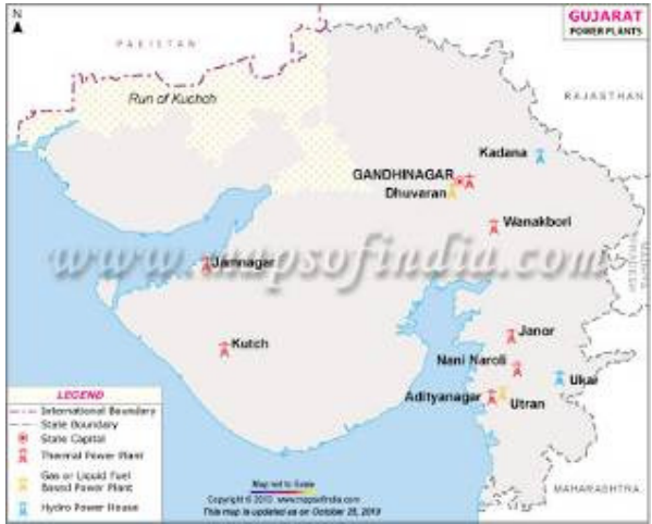
Fig. Gujarat thermal power plant Lime

Using lime in this research work because its own desire properties with mixing other materials, which is describes below. Lime has many, complex qualities as a building product including workability which includes cohesion, adhesion, air content, water content, crystal shape, board-life, spread ability, flow ability; bond strength; comprehensive strength; setting time; sand carrying capacity; hydrolocity; free lime content; vapour permeability; flexibility; and resistance to sulphates. Lime is calcium containing inorganic material which carbonates, oxides and hydroxides predominates. Lime is a calcium oxides or calcium hydroxide. These materials are still used in large quantities as building and engineering materials (including limestone products, concrete and mortar) and as chemical feedstock's, and sugar refining, among other uses. We have using locally available lime from the market.