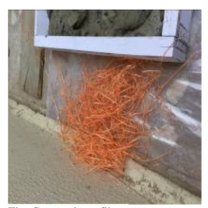
Fig. Cement begs fibers 4) THE DESIGN PRE MIX DESIGN RESULT Clay Test Result before Design<sup>[7]</sup>: This all test performed under the Indian Standard codes. Table: Preliminary test result