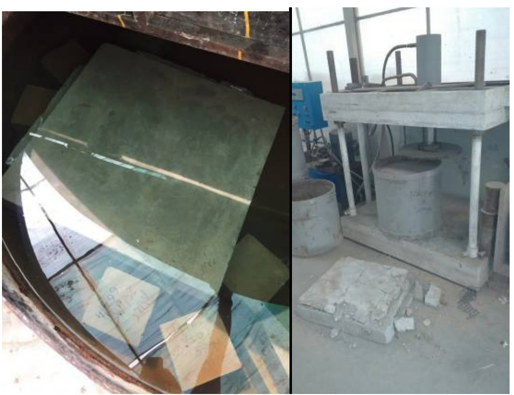
Figure 5.1 Water absorption and Compressive strength

We got 4.1 N/mm<sup>2</sup> compressive strength, which is higher than the conventional type of brick or fly ash brick. We achieved higher strength; it is encouraging to develop the low cost housing projects by this clay wall. Higher percentage of water absorption gets result in decrease the strength. We got 12% of water absorption, which is lower than the conventional brick. We got 1500 kg/cm<sup>3</sup> density, which is lower compare to the conational brick or fly ash brick. Lower density gets result to obtain low weight. Above tests result fulfil the requirement based on our aim or objective of research work.