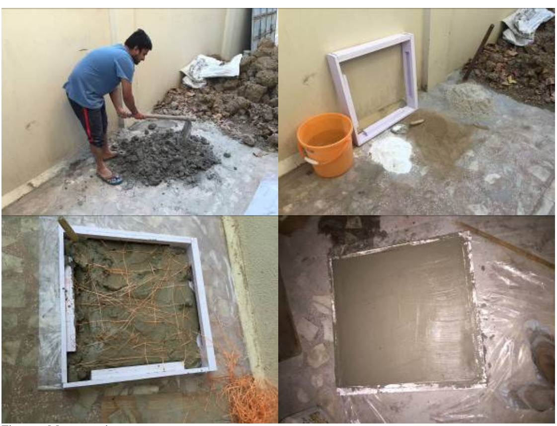
Figure: - Mortar casting