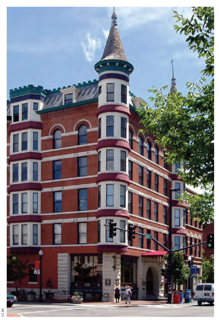
The iconic "Idanha" – first opened as a hotel in 1901 and once the tallest building in Idaho – is one of several downtown Boise buildings that include low or moderate income apartments.

In 2004 CCDC advocated on behalf of a building code amendment that promoted