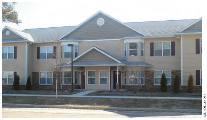
Gateway Village Apartments in Frankfort, Michigan.

In the grand scheme of things, 36 affordable apartments may not sound like a lot, but in a small city like Frankfort located in a rural county facing a lack of workforce housing, the apartments have been a valued addition.