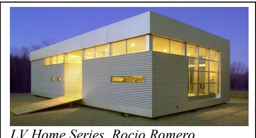
LV Home Series, Rocio Romero

The LV Home Series by Rocio Romero is a 1,150 sq. ft., two bedroom, two bath affordable prefabricated home. Named for Laguna Verde, Chile, where the designer developed the concept, the basic kit (wall panels, structure, and cladding) costs about $32,900, and although it does not include windows, roof, foundation, and interior finishes, it averages around $87/sq.ft. when