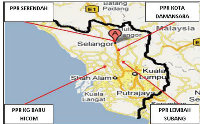
Fig. 2. Overview location of case study on PPR flats at Selangor