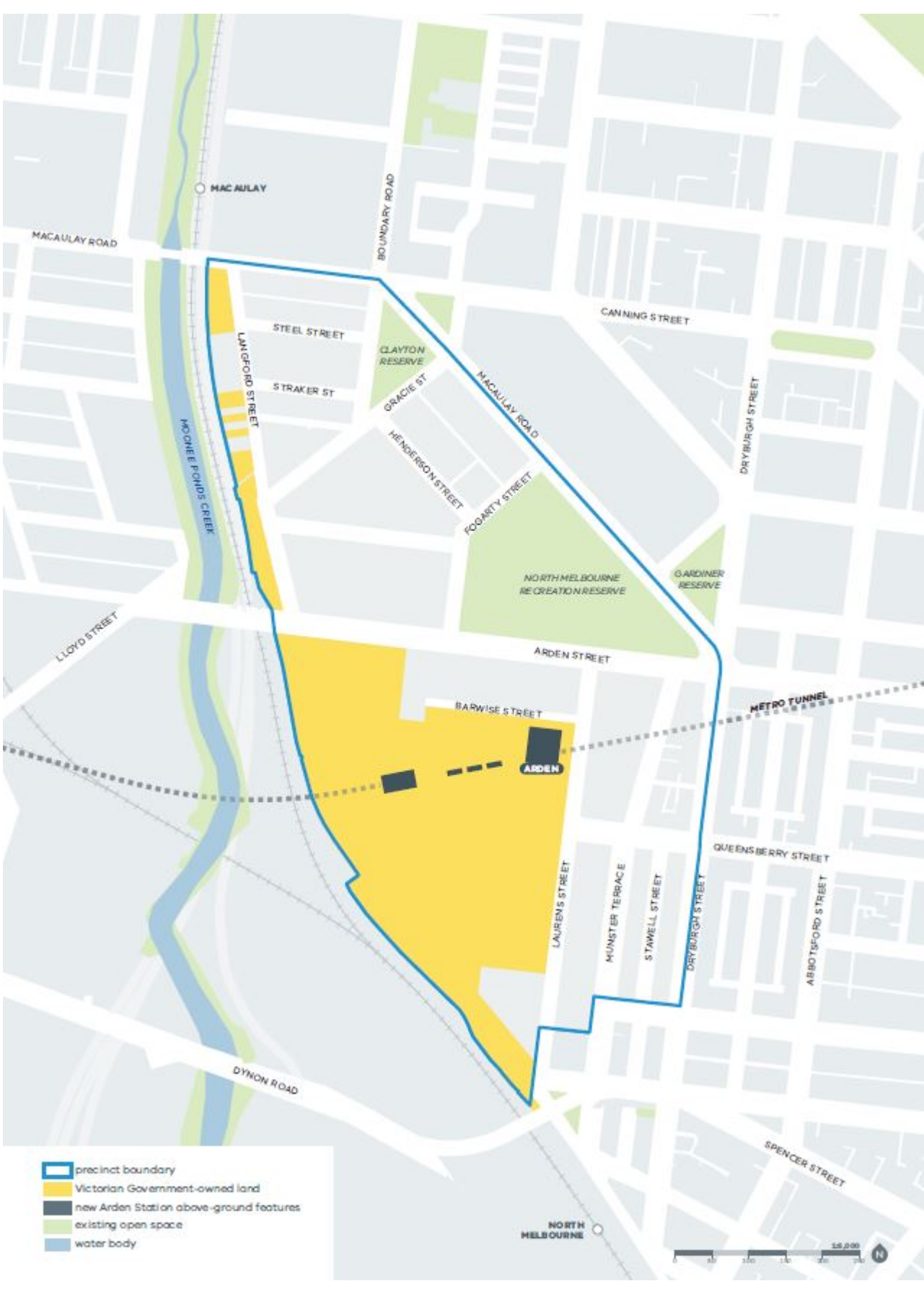
Map 1- Arden Urban Renewal Precinct Ownership