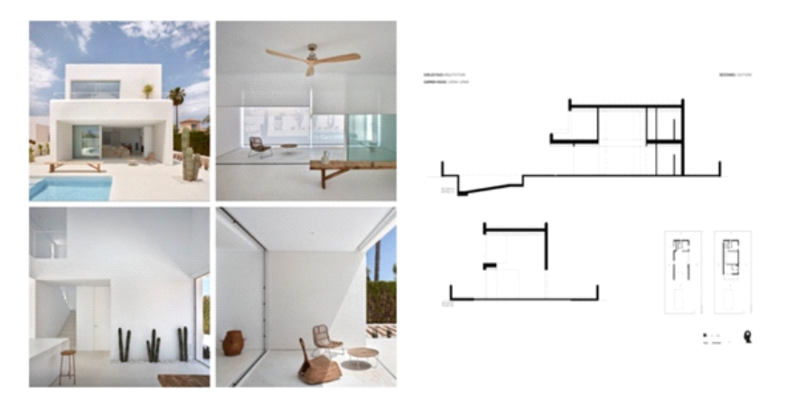
Figure 4: a) Façade, main living space, porch and kitchen; b) Sketch sections and plans of Carmen House, Algemesí, Spain.

The location of interior space is defined by a pathway of daylight which proceeds from a large entryway overlooking the pool in the foreground. The entryway serves dual functions by also mitigating the entry of sun during the hottest months of the year making it comfortable to use the space all year round. The simple rectilinear main floor plans are open, multifunctional, double-height spaces which break the exterior continuity and the building access has been generated through a side access located on the north façade. The building is painted in a stark white finish which is almost indigenous to the Spanish setting and even black shadows seem slightly faded against the white background. The entire construction comprises micro-cement which is less liable to wear and tear and requires nothing more than a touch up of paint every couple of years. The influence of minimalism on the design can be seen in the crisp lines defining the few boundaries between spaces, simplicity in both form and function, uncomplicated wall finishes, simple detailing devoid of decoration and strategic use of locally sourced materials, both internally and externally.