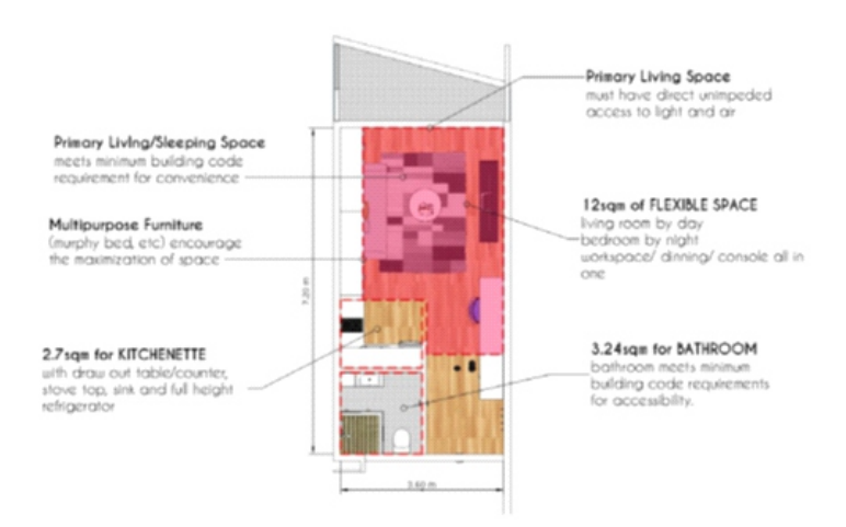
Figure 6: Typical floor plan of standard micro unit apartments on Fola Agoro road.