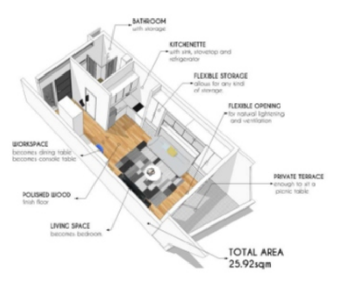
Figure 5: Arial perspective of standard micro unit apartment on Fola Agoro road.

micro apartments in a 7-storey mixed use complex designed by Naomi Ogunderu which appears to successfully fuse traditional elements of multipurpose spaces with communal interaction spaces in an updated, practical design.