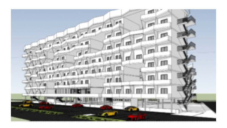
Figure 7: Perspective view of prototype micro unit apartment block on Fola Agoro road.