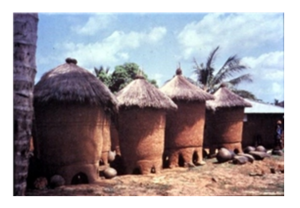
Figure 1 (L-R): Traditional African homestead layout featuring circular storage silos, rectilinear living spaces arranged to encourage both privacy and communal activities.

The Minimalist Movement in architecture finds its roots in the principle of the "less is more" theory held by the Cubism-derived movements known as De Stijl and Bauhaus advocated by the likes of Ludwig Mies van der Rohe, Theo van Doesburg and Gerrit Rietveld (Zimmerman, 2009). The application of this principle seeks to create alternative, multifaceted solutions for decent living and working spaces that incorporate sustainable features which reduce the cost of building construction and maintenance. The movement utilises geometric forms to create simple building arrangements, open floor plans, minimal interior walls, modest storage areas, and an emphasis on views and daylight.