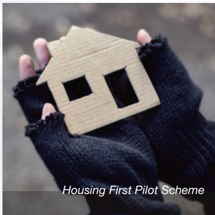
Housing First Pilot Scheme