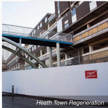
Heath Town Regeneration