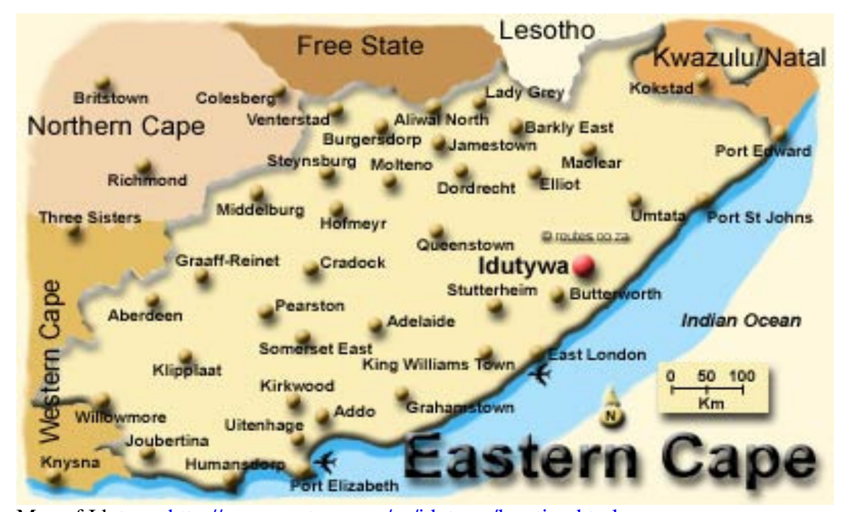
Map of Idutywa <a href="http://www.routes.co.za/ec/idutywa/location.html">http://www.routes.co.za/ec/idutywa/location.html</a>