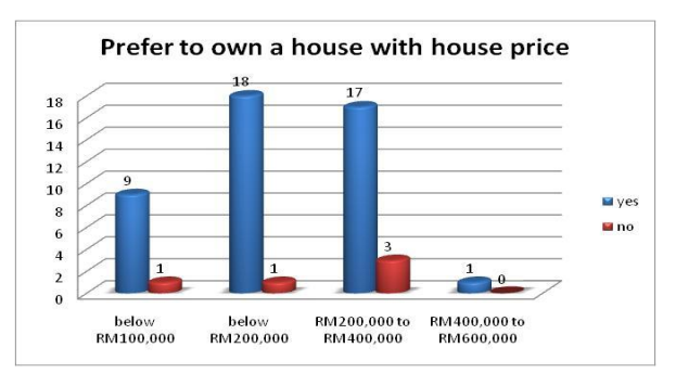
Fig. 1. Prefer to own a house with the respective housing price.

The first issue measured in this study was on housing price; the housing bubble and/or the extreme increase in the price of the houses is considered the main issue faced by the middle-income group in Malaysia, and the result was highlighted in Fig. 1: